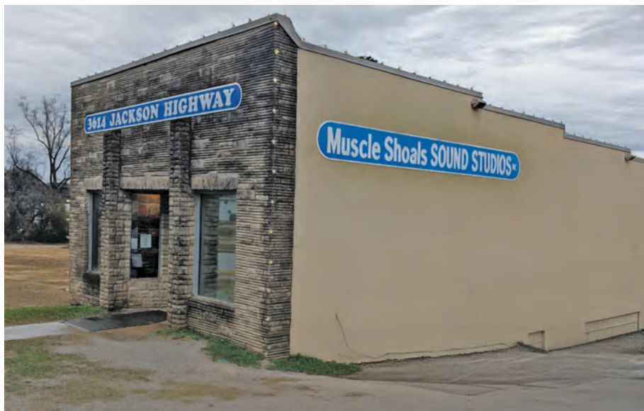
"NOW MUSCLE SHOALS has got the Swampers, and they've been known to pick a song or two" at Muscle Shoals Sound Studios.