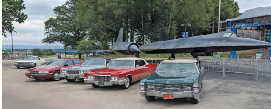
VINTAGE IRON and vintage titanium at the U.S. Space & Rocket Center. Peach State Region members displayed their Cadillacs alongside the blindingly fast SR-71 Blackbird.

jackdaniels.com/en-us/visit-us/miss-mary-bobos-restaurant