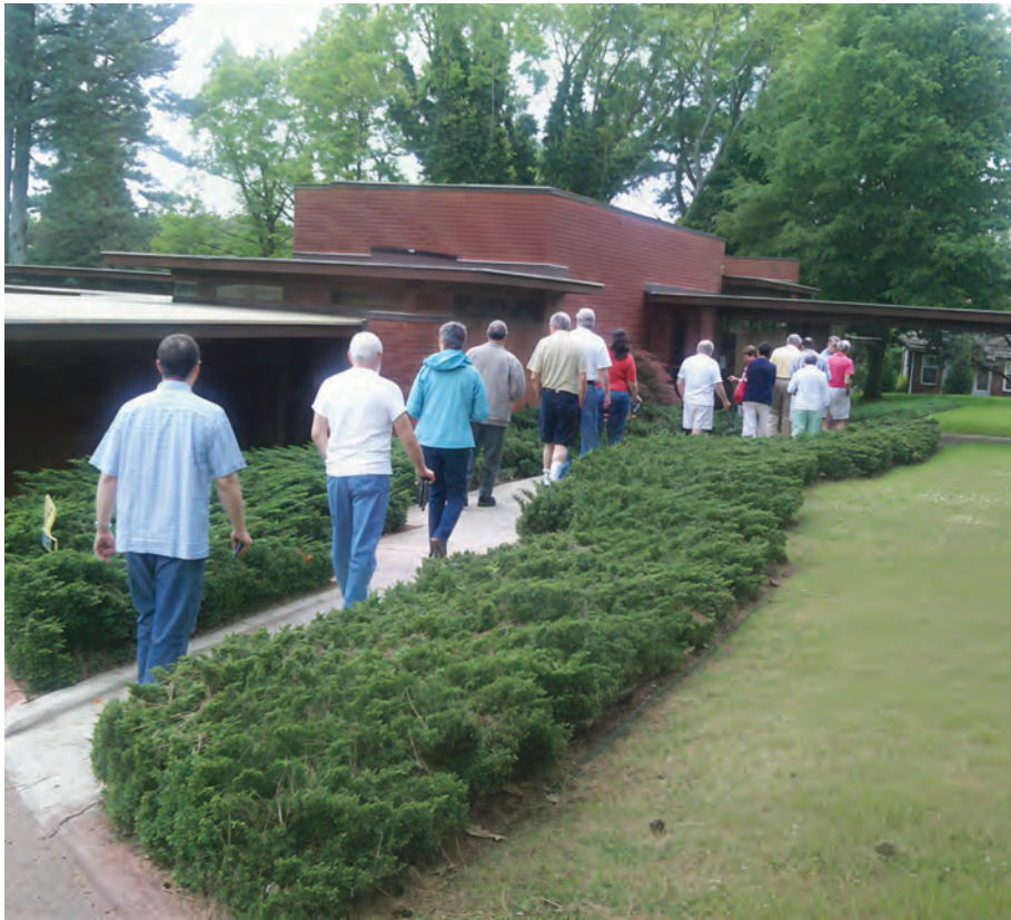
FANS OF FRANK LLOYD WRIGHT will enjoy visiting the Rosenbaum House, one of 26 surviving “Usonian” homes dating to the pre-war era.

photo taken at one of the many space scenes. Make time for shopping in the enormous gift shop!